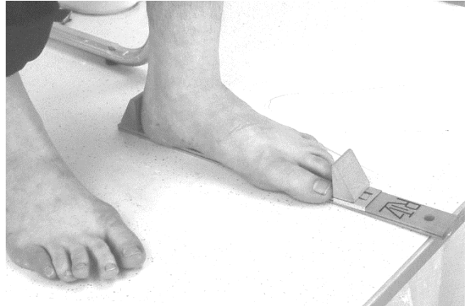
5 The length of the foot is checked while sitting and again in the standing position.