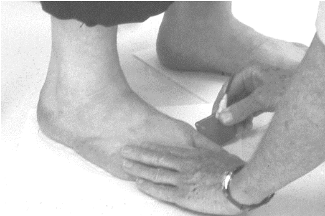
4 The caster is making a tracing of the foot in the standing position. Notice how the arch has changed between sitting and standing. The forefoot has also spread and you can't see the toes, but they have lengthened somewhat.