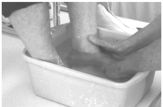
37 The cleansing of the feet is important. Little bits of plaster can be annoying. Do the best you can.