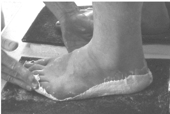
18 The plaster splinting material is brought up around the foot.