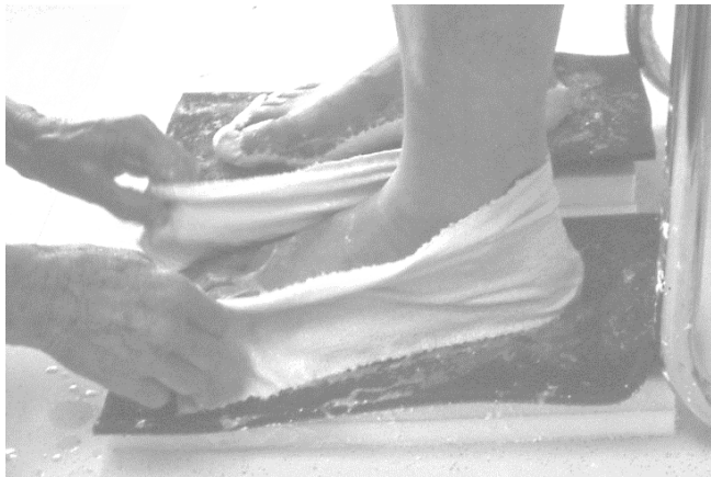
22 The plaster splint material is being wrapped around the back of foot and the ends are brought forward.