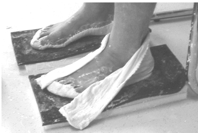
24 One half of the opening is completed.