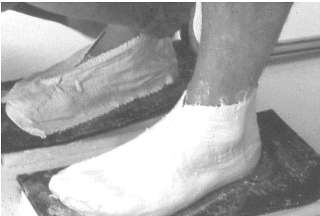
28 The caster is placing the plaster splint material around the right foot.