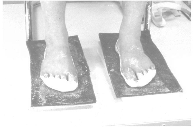
21 Front view.