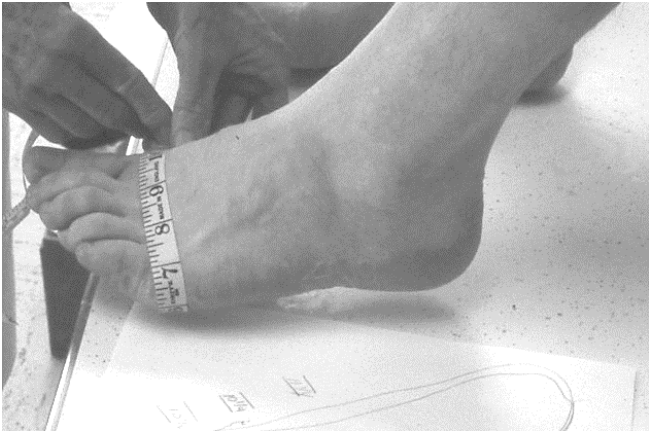
10 Don't be afraid to go back and re-check any measurement.