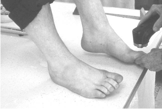
2 The feet are being shaved to remove the hair.