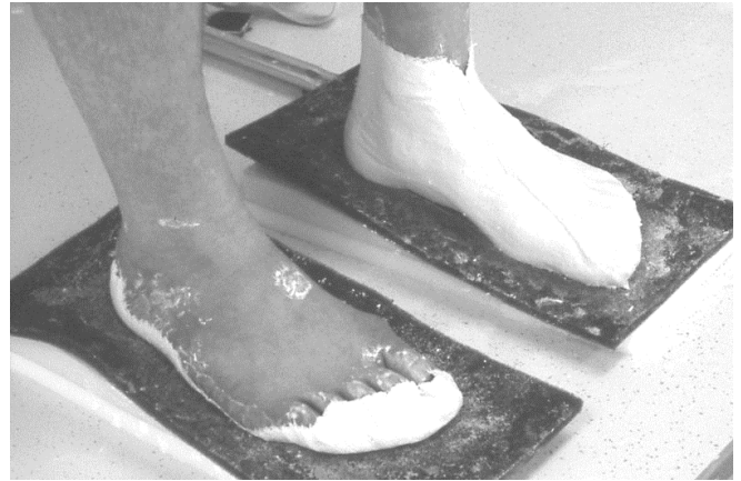
27 View of medial side.