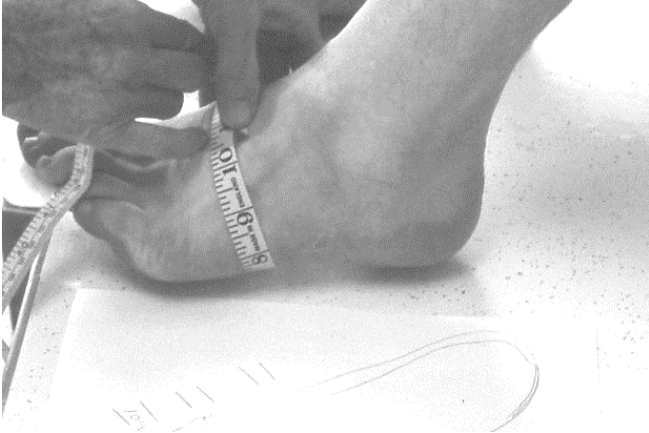
8 The circumference around the waist of the foot is measured.