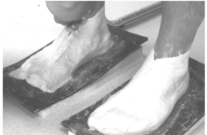
29 The front opening seam is being made.