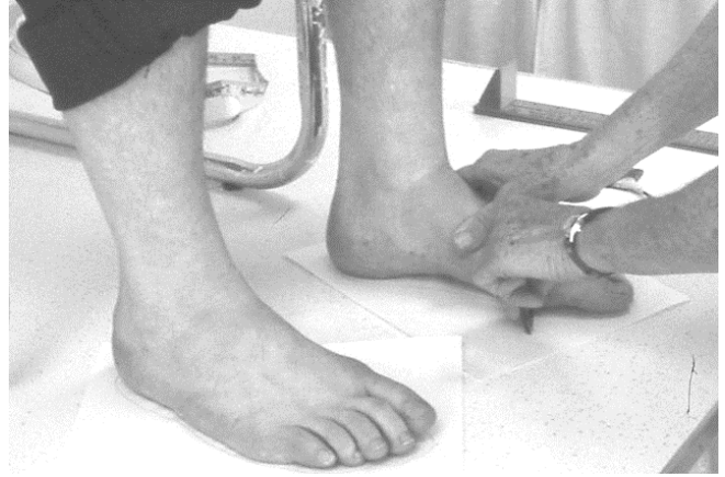
3 The caster is making a tracing of the foot in the seated position.