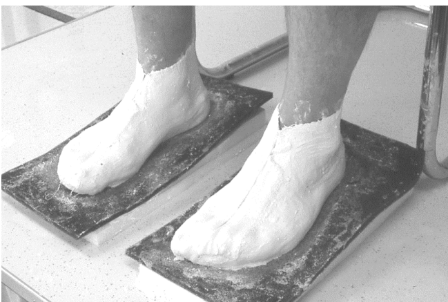
30 View number 1.