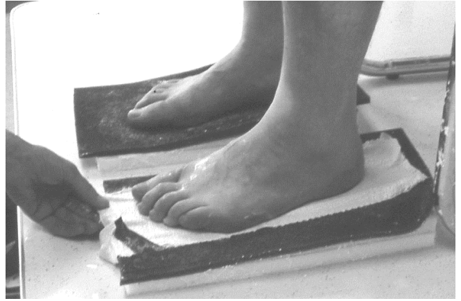
17 The plaster splinting material is placed under the foot. The foot pads are re-positioned as needed to get proper alignment.