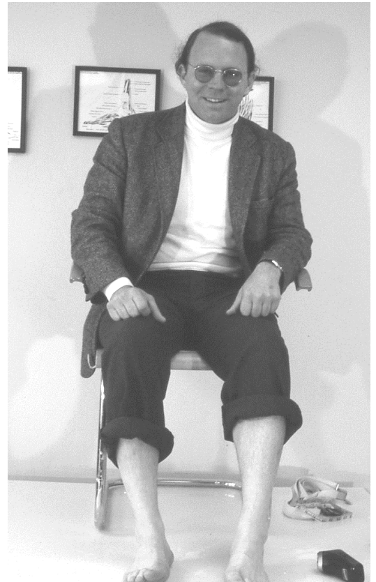
2 This client has posed for a "how not to sit" posture. The caster is going to get this client to cooperate, so a good cast can be obtained, in order to get a good pair of shoes