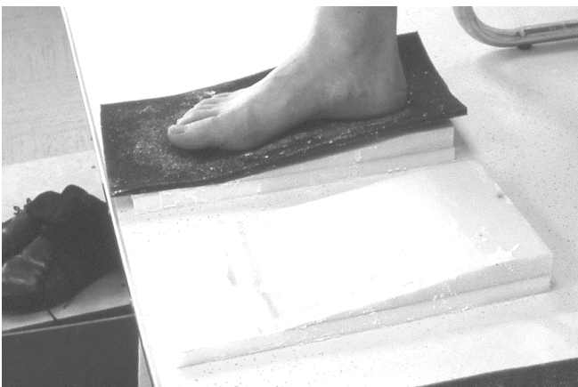
12 The foot is placed on the foot pad.