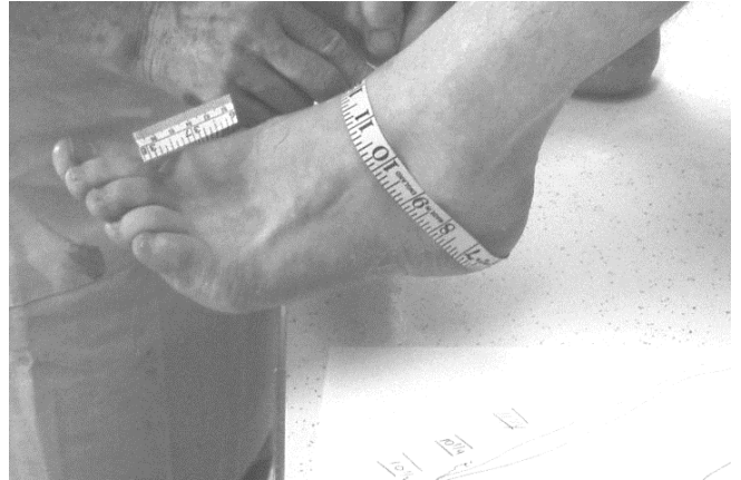
11 The circumference around the ankle joint and heel is measured.