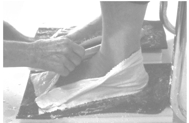
23 The caster is just about ready to make the center opening, but it is essential to first get the side coverage proper.