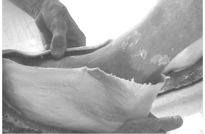
33 The foot is beginning to come out. Don't rush this event, pull gently and wiggle. The caster can even open the cast fully, separating the top from bottom. It will go back together again with no distortion if done carefully.