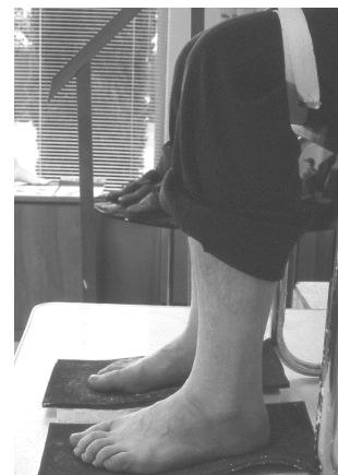
13 The leg strap or straps are placed, and the foot pads are moved to get the proper alignment.