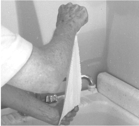
16 The plaster splinting material is wet and drained.