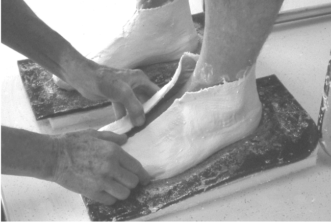
32 The plaster splinting material has firmed enough to open the front seam. Notice how the foot form is not being distorted.