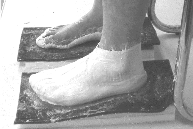
26 The front opening seam has been completed. The upper collar on top of the ankle is very nice. The molding to the foot looks very good.