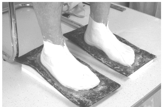
31 View number 2.