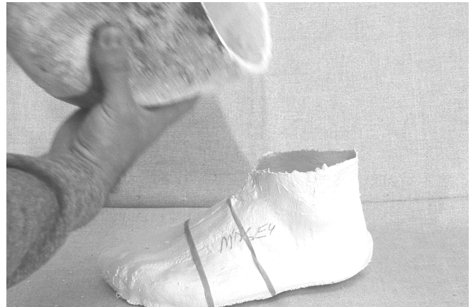
41 After the cast has dried two to four hours, it is usually ready to be filled with plaster. This is covered in a future chapter.

Casting for sandals is the same as casting for shoes.