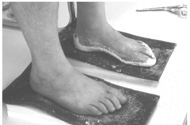
19 The plaster splinting material at the arch has been molded up to conform to the contour of the arch.