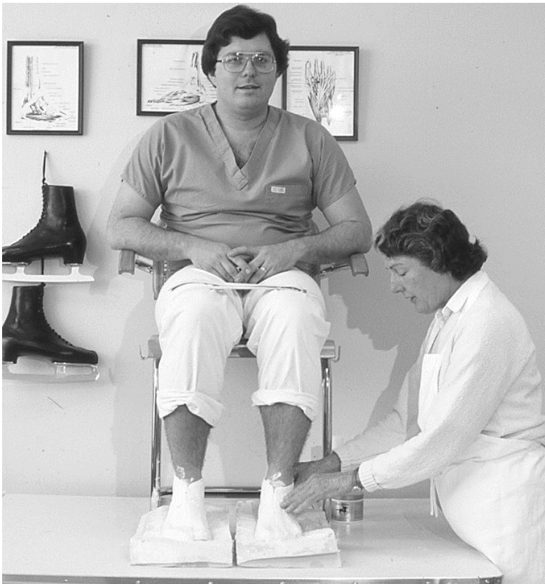
1 This client is sitting very nicely. The casts are almost dry enough to be taken off.

The measurements taken of the feet and the foot shape outlines, made before the casting, will be covered in another chapter. It is important for the caster to consider what information collected now will help later in the fabrication process when the customer is gone.