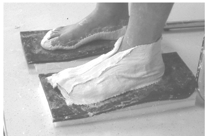
25 Now both halves of the front opening have been completed.