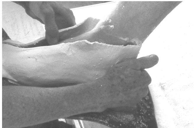
35 The right cast is being removed.