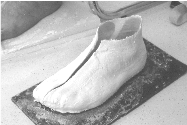
34 The wrap cast is complete. It needs the rubber bands to hold it together. Always be gentle with this cast. It is still wet. Good setting takes about a half an hour or more before it should be handled.