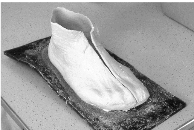
36 This cast looks nice. The toes, bunion and ankle bones are all visible on the outside of the cast. The real form wanted is in the inside of the cast. This is just a shell to capture the form of the foot so a replica of the foot can be made.