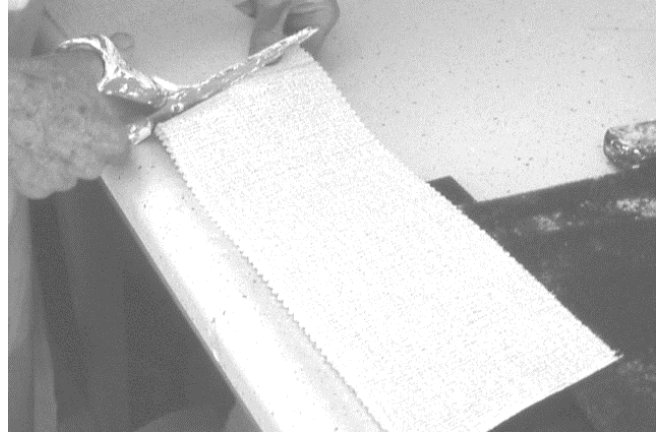
15 The plaster splinting material is cut.