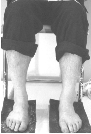
14 Front view of alignment.