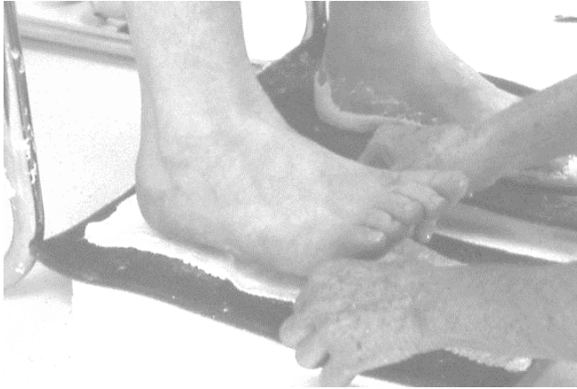
20 The bottom plaster splint material is being placed under the right foot.