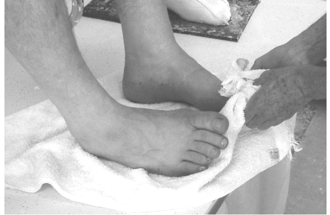
39 Drying the feet.