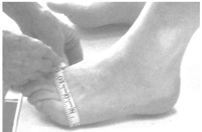
7 The circumference around the ball of the foot is measured.